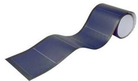
Amorphous thin film 66Wp/m 2

General Solar PV is a roof waterproofing membrane with thin film technology photovoltaic cells embedded into its surface. The system is installed onto the usually under resourced roof area as the top layer in a multi layer waterproofing and insulating system. Because they perform much better in low light conditions, thin film collectors have been shown in trials to generate more electricity per kWp installed than do traditional panel systems. The solar collectors cover 100% of the surface of the membrane thus maximising generation from the available space. Approx 17m 2 are required for 1kWp which, in the London area, means that a 100m 2 roof would generate approximately 5,000 kWh and save 2.5 tonnes of CO 2 per year. The system is guaranteed to continue to generate at least 80% of the installed power after 25 years.