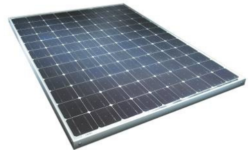
Crystalline panel 100 to 130 Wp/m 2

Mono or polycrystalline panels typically have an efficiency between 15 and 18% but because the technology is expensive to manufacture it does not scale up too well. Thin film technology, though not so efficient, between 7 to 10%, is cheaper and is therefore ideal for large surfaces. Output is measured in kilowatt peak (kWp) and in the UK approximately 800 kWh of energy will be generated in a year for every kWp installed.